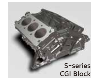
S-series CGI Block

The most advanced technology from one of the world's leading car companies goes straight into our engines. Stiffer engines for longer life with components* such as blocks and cylinder heads made of Compacted Graphite Iron (CGI). Better fuel economy with Common Rail Direct Injection (CRDi) on our high speed engines and Electronic Unit Injectors (EUI) on our medium speed engines.