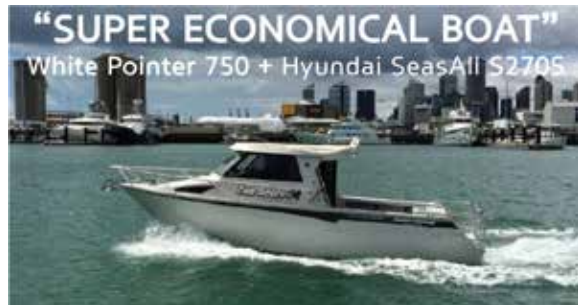
Fuel Consumption Comparisons

Speaking of numbers... Thinking about petrol sterndrives or petrol 4-stroke outboards?